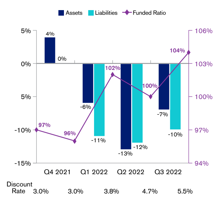
Graph 1: Change in Assets, Liabilities and Funded Ratio<sup>2</sup>

Plans' liabilities are measured with the yield curve, determined by reference to high-quality corporate bond yields. Changes in the shape of the yield curve may have varying impact on plans' liabilities based on their maturity. (For background on yield curves, read our primer.)